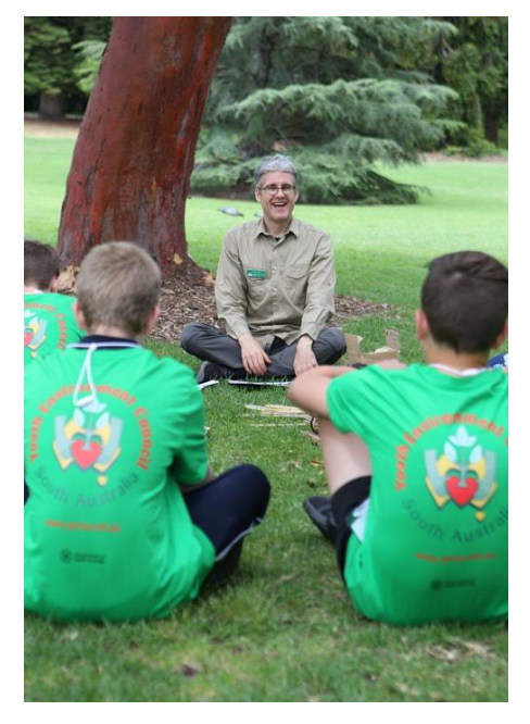
YEC members and staff participating in an activity together

The Celebration Forum is an exciting day, but we also understand that there are a lot of new faces and information to take in. If you start to feel overwhelmed at any stage, unwell, uncomfortable participating in an activity, or unclear about any instructions, then you can talk to one of the Education staff or mentors. We will be able to have a chat with you, help you to find a quiet place to take some time out if you like, and/or support you until you feel comfortable re-joining the group.