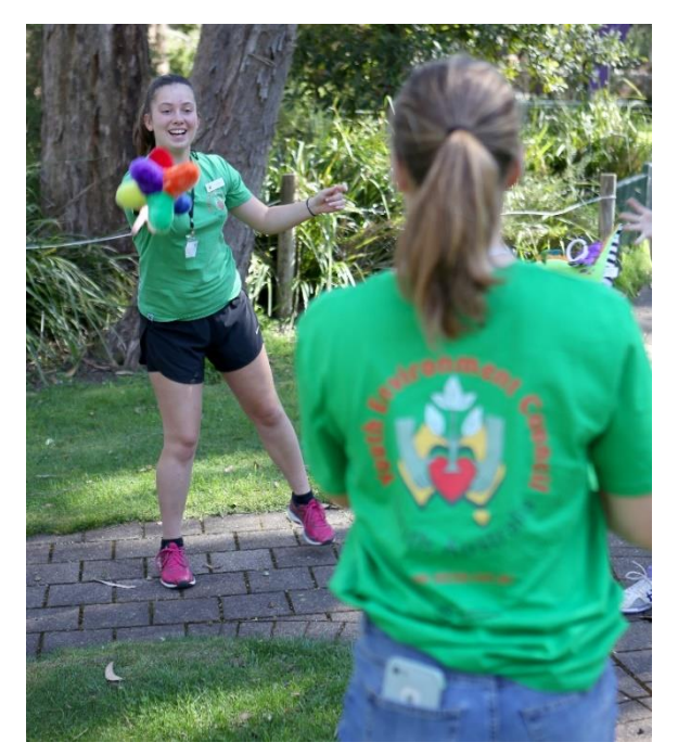
YEC members playing an icebreaker game

There will be an opportunity to set up your poster and/or display demonstrating your YEC project, for staff and members to see during the day.