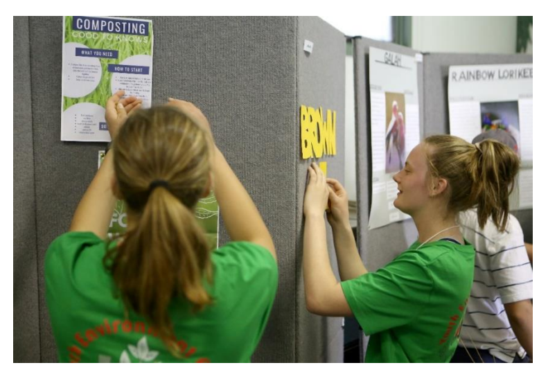
YEC members setting up their project displays

There will be an opportunity to set up your poster and/or display demonstrating your YEC project, for staff and members to see during the day.