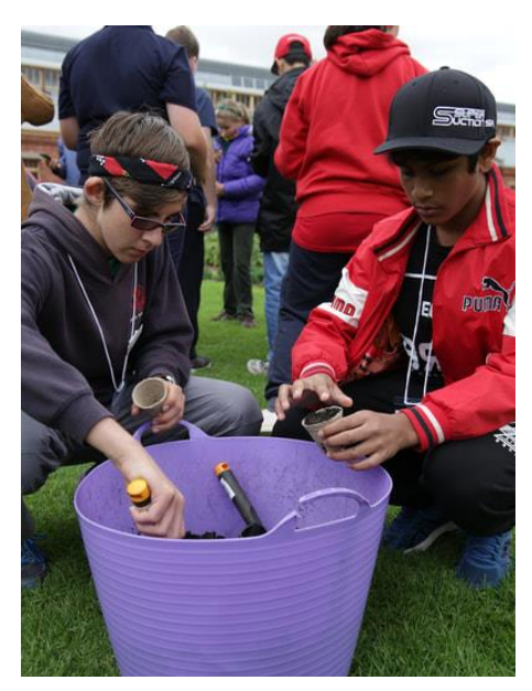
Students doing a hands-on activity

The Celebration Forum is an exciting day, but we also understand that there are a lot of new faces and information to take in. If you start to feel overwhelmed at any stage, unwell, uncomfortable participating in an activity, or unclear about any instructions, then you can talk to one of the Education staff or mentors. We will be able to have a chat with you, help you to find a quiet place to take some time out if you like, and/or support you until you feel comfortable re-joining the group.