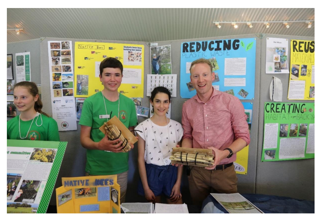
YEC members with the Minister for Environment and Water

As well as YEC members and staff, we will invite the Minister for Environment and Water, as a special guest to see the great work you have all done this year.