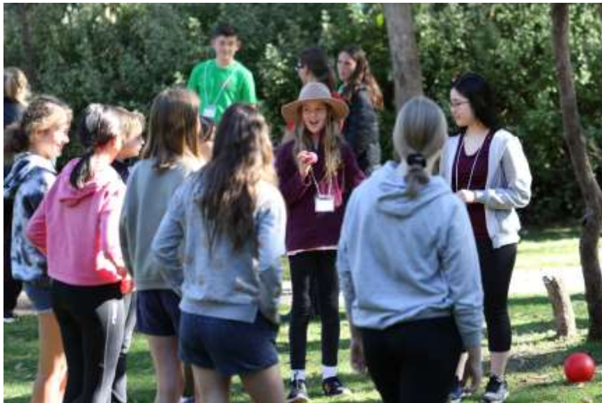
Students participating in a group activity

At the forum you will find out more about the project element of the YEC and see examples of projects from past members.