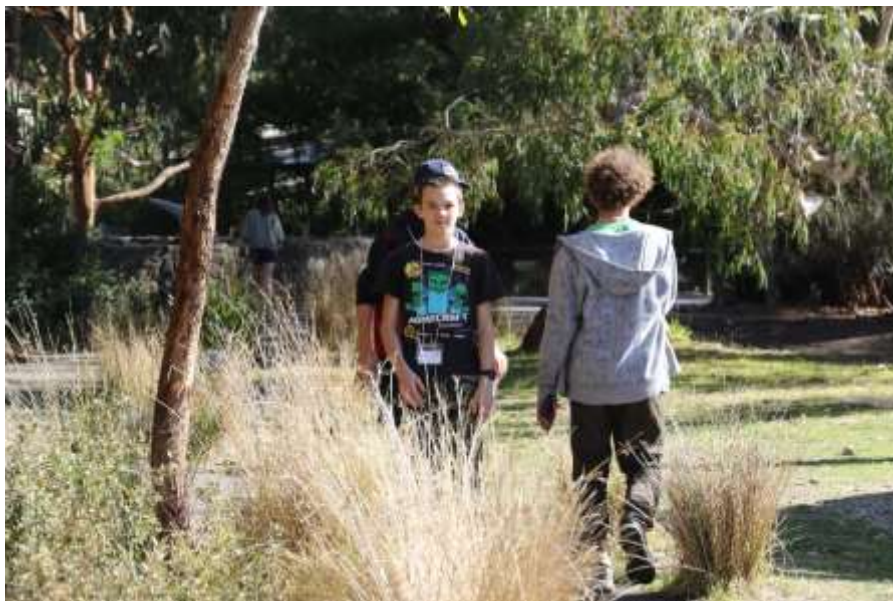
Students exploring the park

If we move around the park for activities during the day, we'll give everyone a reminder in case they have any medication or items they would like to bring with them.