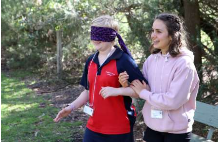
Students playing an icebreaker game

If there's anything you would particularly like us to know so that we can best help you to participate, you or your parents/carers can also let us know before the day and we'll follow your recommendations on how you'd like us to support you.