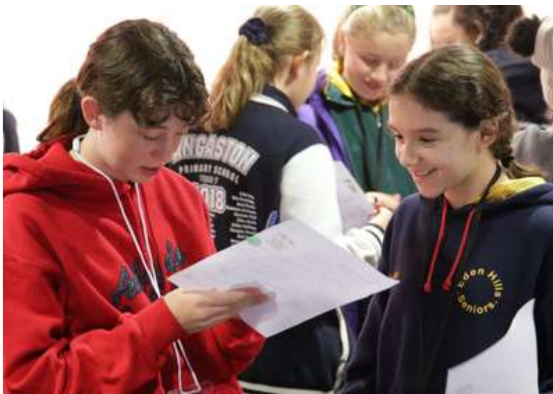
YEC members networking

There will be up to 60 students at the forum. For most of you, this will be your first time as a YEC member. Students will be coming from different schools across South Australia, and may represent Kangaroo Island, the Riverland, Eyre Peninsula, Mid North, Yorke Peninsula and Limestone Coast, as well as metropolitan Adelaide.