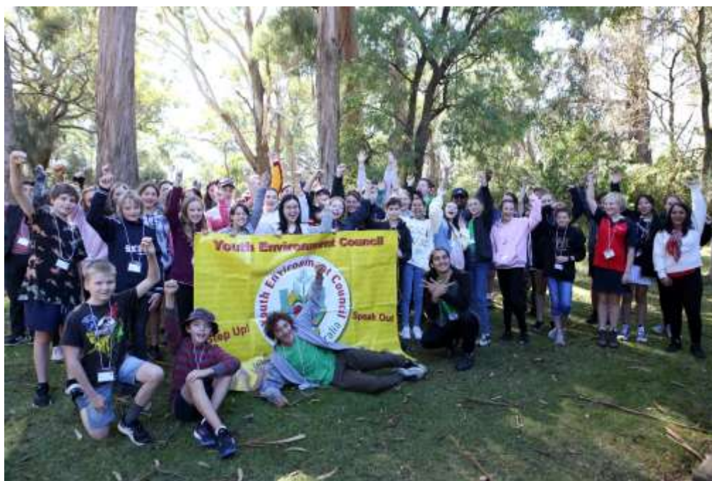
YEC members at the 2021 Welcome Forum

The first event for this year's Youth Environment Council (YEC) is the Welcome Forum, held at Belair National Park. It will be an exciting day where you will meet and share ideas with the other Council members, participate in fun activities, and find out more about the program.