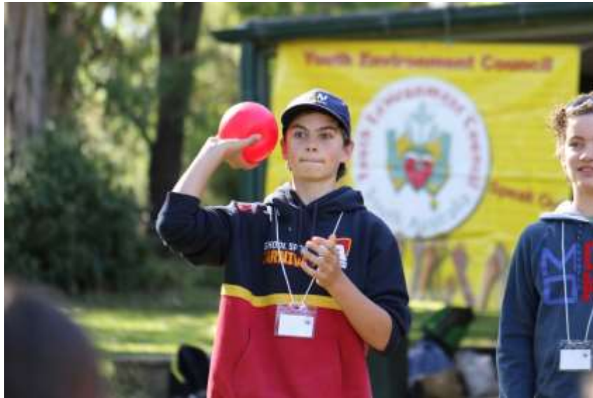
Students playing an icebreaker game

In the morning, we will outline the general rules for the day and discuss ‘group norms’, which are guidelines for how we will behave as a group.