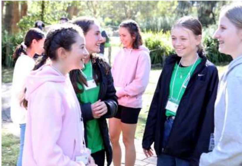
YEC members at the 2021 Welcome Forum

There will be up to 60 students at the forum. For most of you, this will be your first time as a YEC member. Students will be coming from different schools across South Australia, and may represent Kangaroo Island, the Riverland, Eyre Peninsula, Mid North, Yorke Peninsula and Limestone Coast, as well as metropolitan Adelaide.