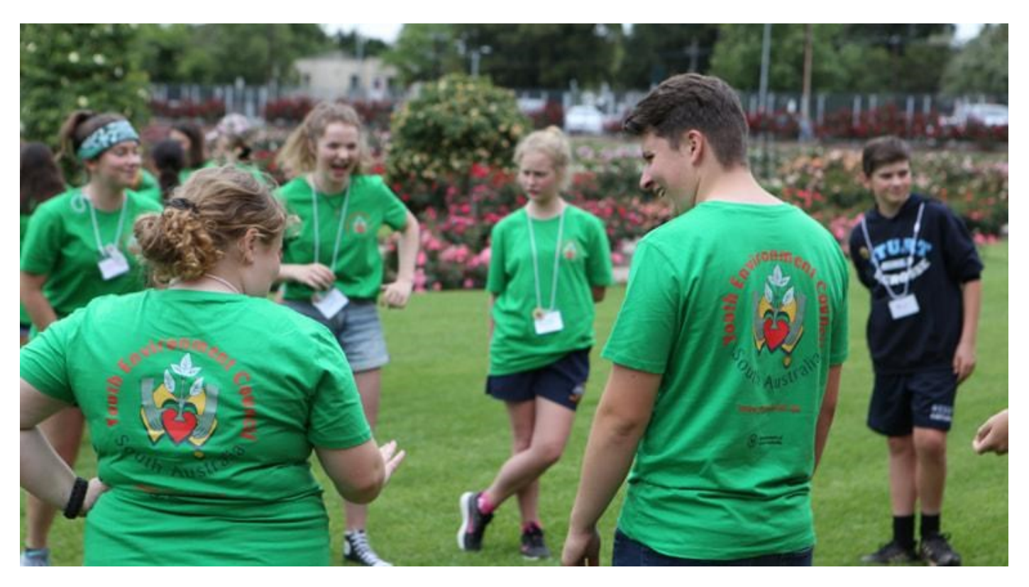
YEC members at the 2020 Forum

We look forward to seeing you on the day!