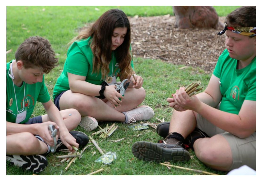
Students doing a hands-on activity

The Sharing and Celebration Forum is an exciting day, but we also understand that there is a lot happening. If you start to feel overwhelmed at any stage, unwell, uncomfortable participating in an activity, or unclear about any instructions, then you can talk to one of the education staff or YEC mentors.