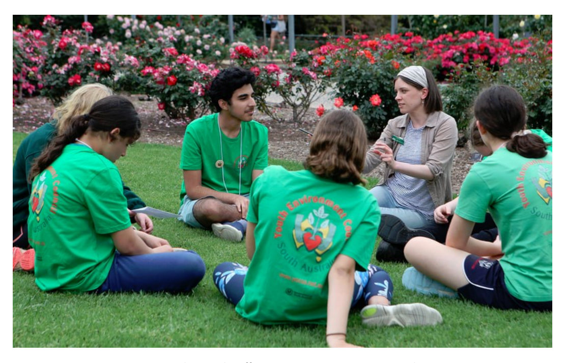
YEC members and staff participating in an activity together

We will be able to have a chat with you, help you to find a quiet place to take some time out if you like, and/or support you until you feel comfortable re-joining the group.