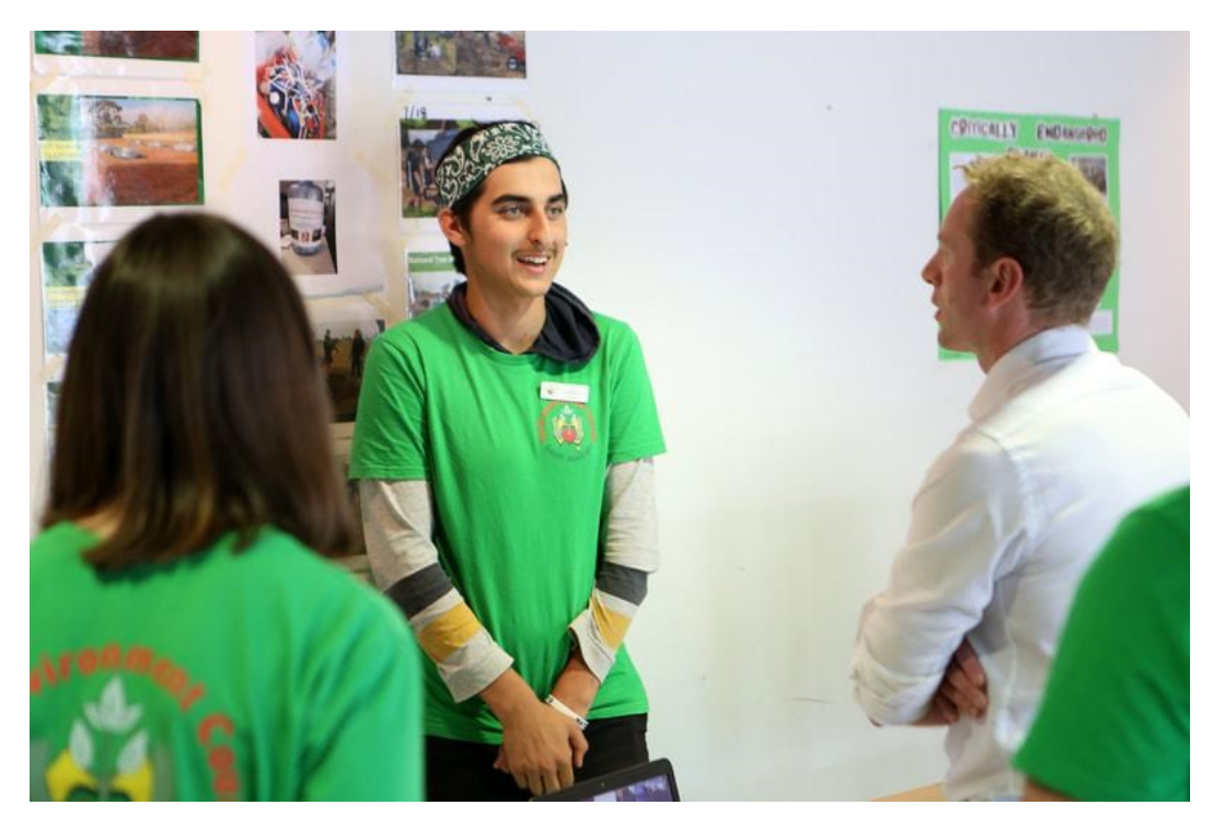
YEC members with the Minister for Environment and Water in 2020

At the beginning of the day, the YEC mentors will lead some 'icebreaker' games helping us to get to know each other. Staff will outline the agenda and general guidelines for the day.