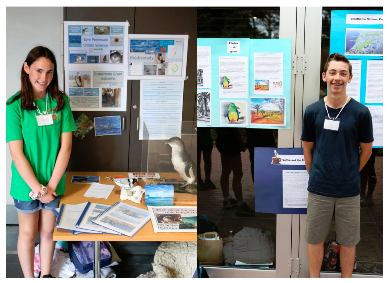
YEC members with their project displays

There will be an opportunity to set up your display demonstrating your YEC project. Your display space will be based on the information you provide us in the RSVP form. Your name will be on your display area at the start of the day so you know where to set up. Staff, guests and YEC members will get to see your project display during the day. You do not need to give a presentation to the big group but have conversations about your project in small groups.