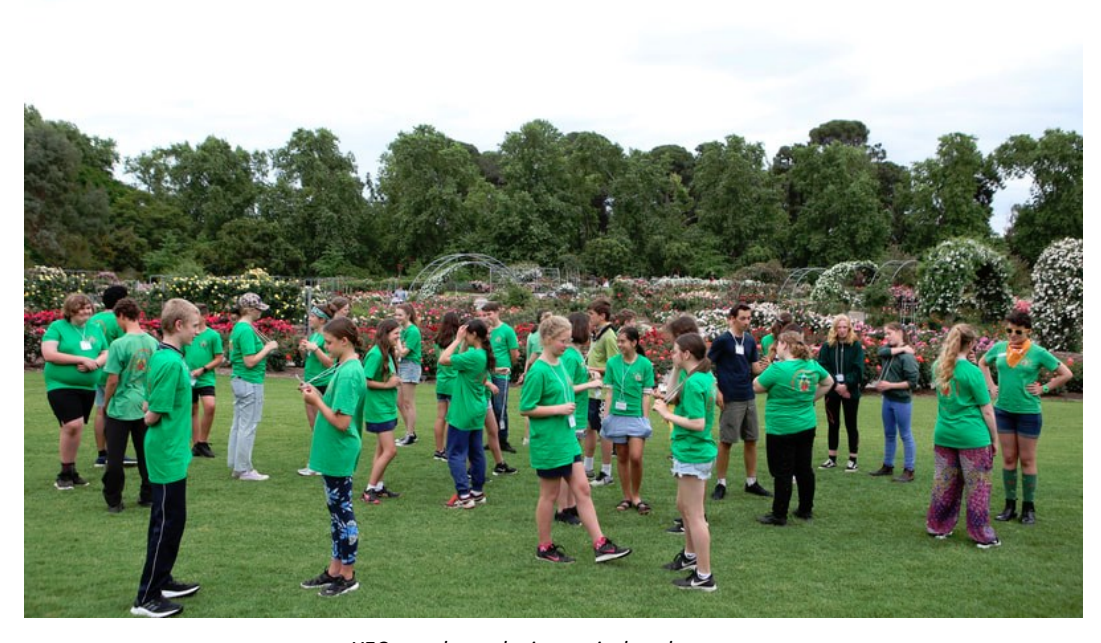
YEC\ members\ playing\ an\ icebreaker\ game

This year's event will feature fun activities and guest speakers, and you will get the chance to share your projects and achievements in small group conversations. These conversations will be recorded so that we can create case studies to add to the YEC website, and share with your family and friends.