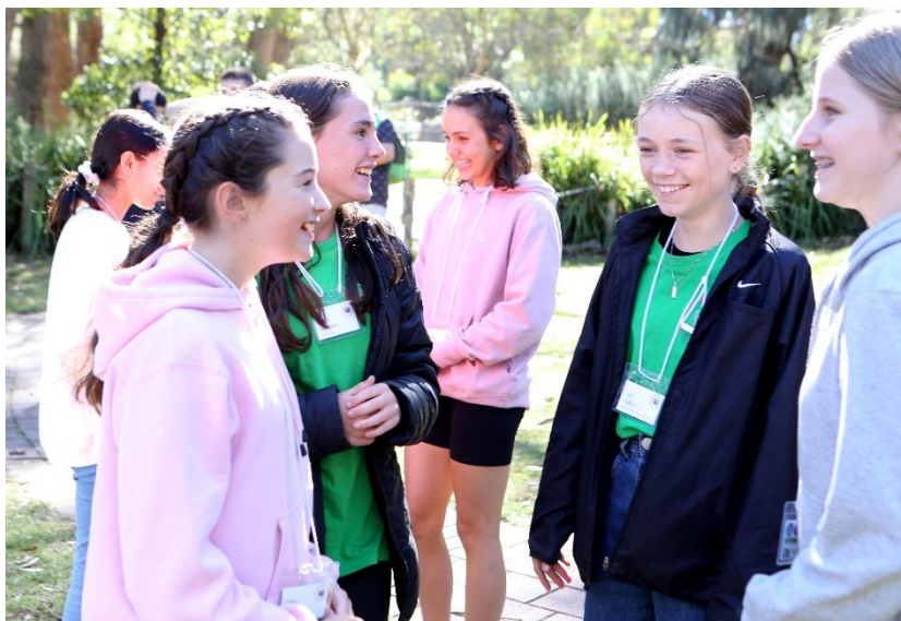
YEC members at the 2021 Welcome Forum

There will be up to 60 students at the forum. For most of you, this will be your first time as a YEC member. Students will be coming from different schools across South Australia, and may represent Kangaroo Island, the Riverland, Eyre Peninsula, Mid North, Yorke Peninsula and Limestone Coast, as well as metropolitan Adelaide.