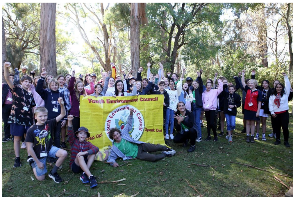
YEC members at the 2021 Welcome Forum

The first event for this year's Youth Environment Council (YEC) is the Welcome Forum, held at Belair National Park. It will be an exciting day where you will meet and share ideas with the other Council members, participate in fun activities, and find out more about the program.