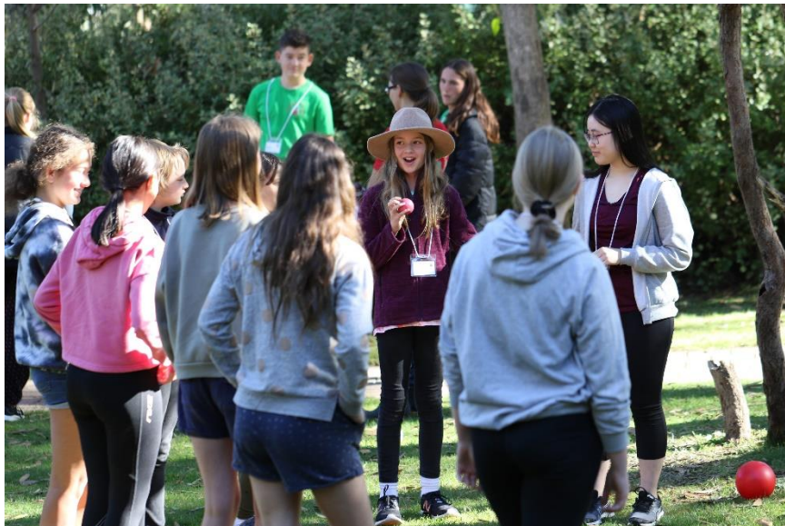
Students participating in a group activity

At the forum you will find out more about the project element of the YEC and see examples of projects from past members.