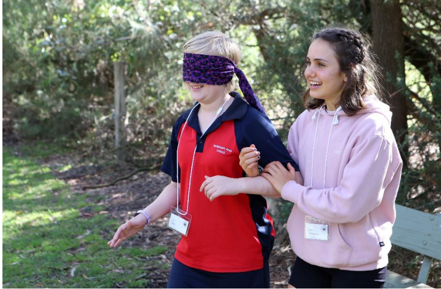
Students playing an icebreaker game

If there's anything you would particularly like us to know so that we can best help you to participate, you or your parents/carers can also let us know before the day and we'll follow your recommendations on how you'd like us to support you.