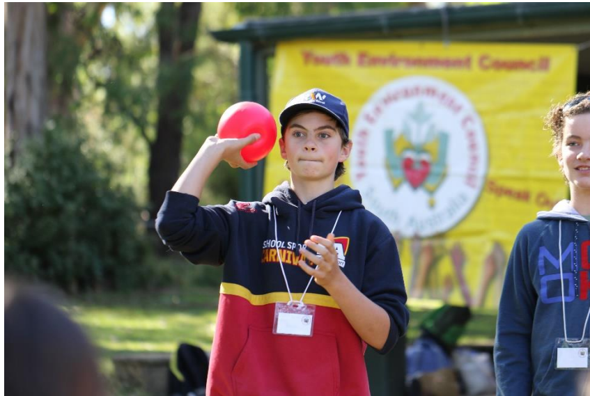
Students playing an icebreaker game

In the morning, we will outline the general rules for the day and discuss 'group norms', which are guidelines for how we will behave as a group.