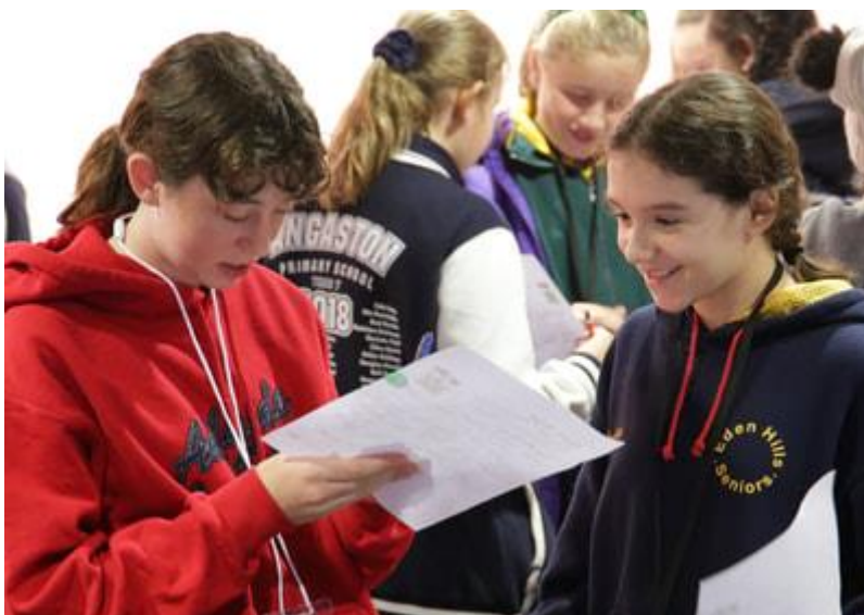
YEC members networking

There will be up to 60 students at the forum. For most of you, this will be your first time as a YEC member. Students will be coming from different schools across South Australia, and may represent Kangaroo Island, the Riverland, Eyre Peninsula, Mid North, Yorke Peninsula and Limestone Coast, as well as metropolitan Adelaide.