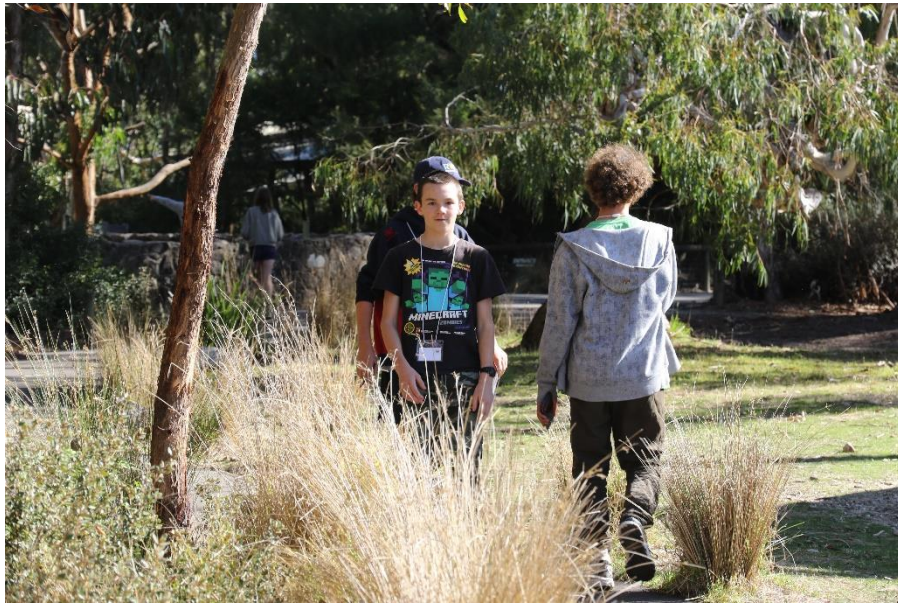
Students exploring the park

The Welcome Forum is an exciting day, but we also understand that there are a lot of new faces and information to take in. If at any stage you start to feel overwhelmed, unwell, uncomfortable participating in an activity or unclear about any instructions, you can talk to one of the Green Adelaide education staff or mentors. We will be able to have a chat with you, help you find a quiet place to take some time out and/or support you until you feel comfortable re-joining the group.